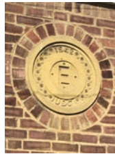
Below: Esher Urban DC detail Lower Green house