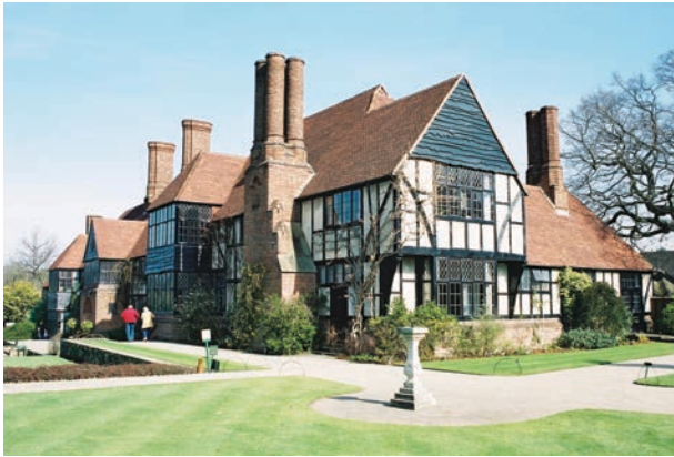
Left: The 'Laboratory' RHS Gardens Wisley

Known as the "Laboratory" this is a focal point of Wisley and considered to be an early example of conservationism as the building was designed to be in keeping with the garden and was built using recycled materials from derelict properties.